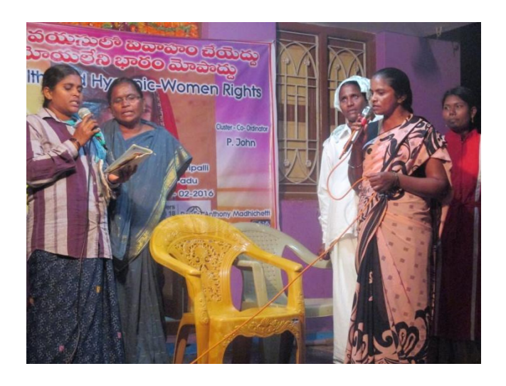
Note: - Pictures of the street plays

Ganugapenta, Kanigiri (Mdl), Prakasam ( Dist) . The women group very well supported in explaining the themes.