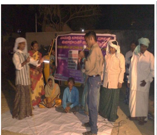
Note: - The pictures of the street play in Chinthagunta village

When the marriage was going on someone had called the police due to child marriage. Immediately the police came at the marriage, enquires all the details about the age of bride and bridegroom. After all the verification of their certificates he came to know that they are (The boy is 17 years, the girl is 14 years) under age. He has given instructions about the government rules and policies about the age of marriage. Finally he asked them to stop the marriage and asked the parents to send their children to continue their schooling. (This was the portrayal of the street play)