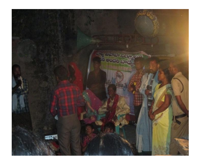
Note: - Pictures of the street play at Ullagallu village